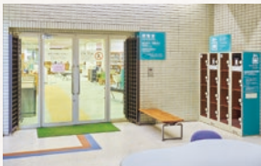
Entrance to the reading room