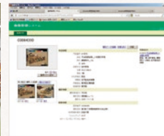
Research and Information Center image search